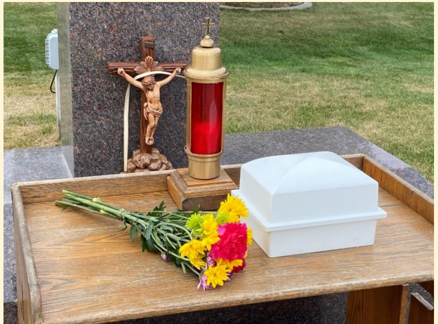
The remains of 42 embryonic children were laid to rest at the August burial.

We are grateful to all who support SHG's mission through your generous gifts and prayers. You are serving Jesus through your care for these, our youngest brothers and sisters.