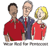
Wear Red for Pentecost

Many Catholics pray a Pentecost novena in preparation of this solemnity. And many parishes honor the neophytes (newly Baptized) and those who were confirmed in the past year. Even in some dioceses, the bishop celebrates Pentecost Mass with the neophytes.